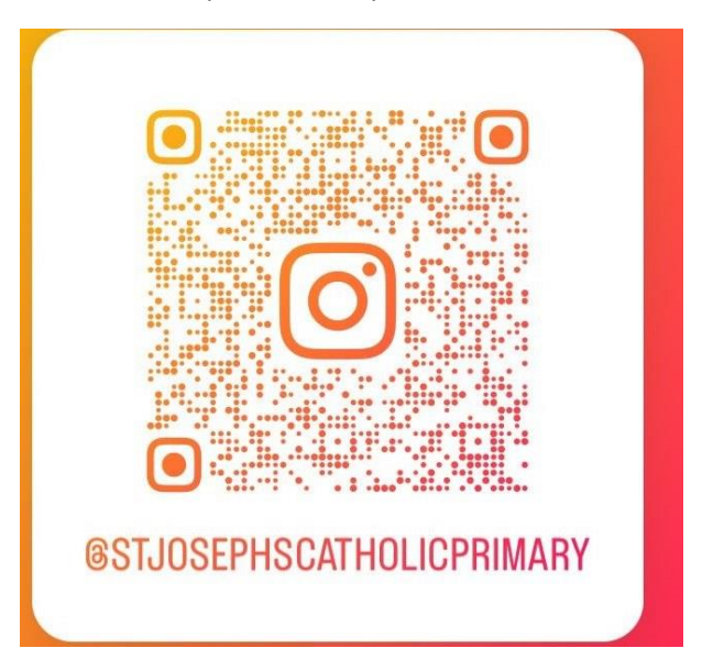
1 - Instagram @STJOSEPHSCATHOLICPRIMARY

Thursday 2nd November 9:00am, 12:30pm and 7:00pm