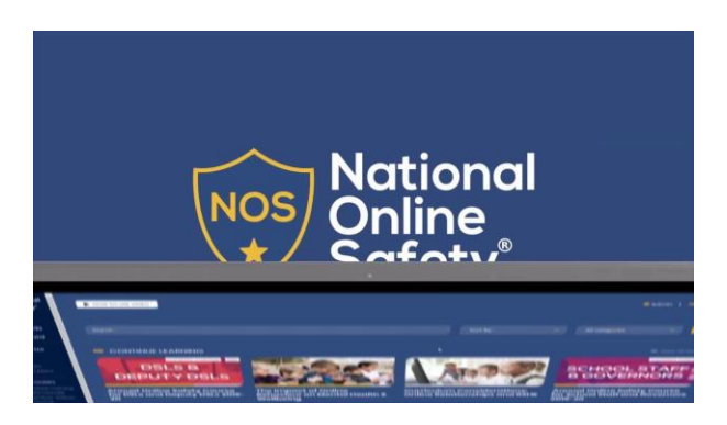
2 - National Online Safety

This week we have emailed you with information on how to sign up for resources, courses and webinars around online safety using the National Online Safety platform. I will shortly add suggested resources to your parent 'watch list' which I believe will be of great support to us all as we keep our children safe in an ever changing environment online. Please do sign up to this fantastic resource which we also use regularly in school. All schools within Emmaus have been provided with this opportunity to support online safety of our children.